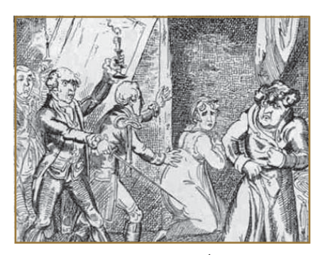
A Magician's newest trick leads to a duel.