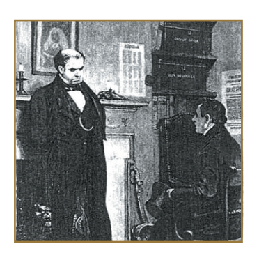
A Blackmailer gets more than they bargained for...