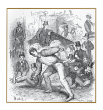
A cab chase following a Public School prank gone awry.