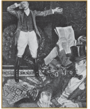
A Master Villain replaces a pawn.