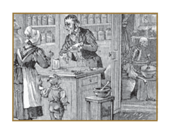
A Chemist creates a strangely popular remedy.