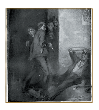
A robbery foiled by a Costumed Figure.