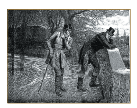
Two Handsome Men claim to be lost in the country.