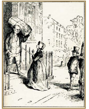
A Famous Detectíve takes a holíday.