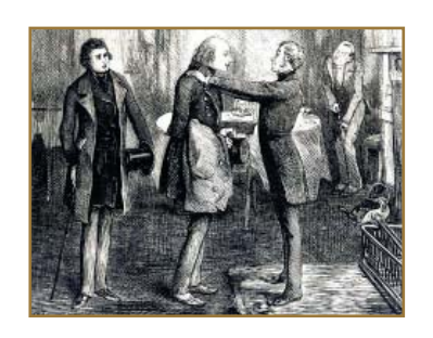
An Old Regimental Chum sends a sentimental gift.