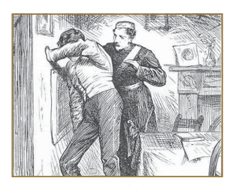
Pages missing from an Author's diary.