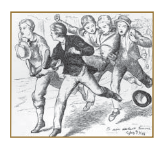
What the Street Urchin witnessed.