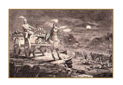
A Modern Marvel suffers a malfunction