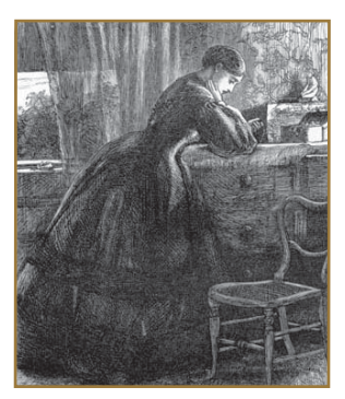
A Lady of Renown loses a cherished bauble.