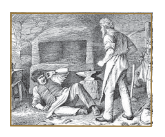
A Killer returns to work in the slums.