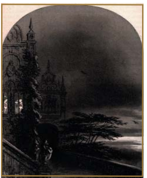
Because of a poorly worded will a Stable Boy inherits a "haunted" house.