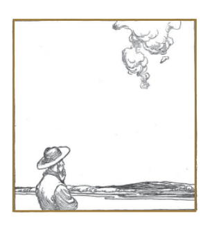
Three pilots in as many days.