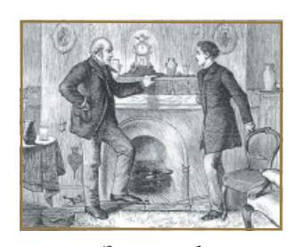
The Last of a Doomed Lineage seeks an appraisal.