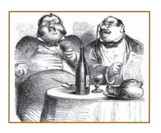
Ríval Inventors meet for lunch