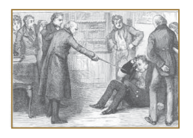
The regrettable mistake of the Confused Constable.