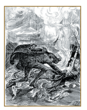
The loss of a Vicarage in a suspicious fire.