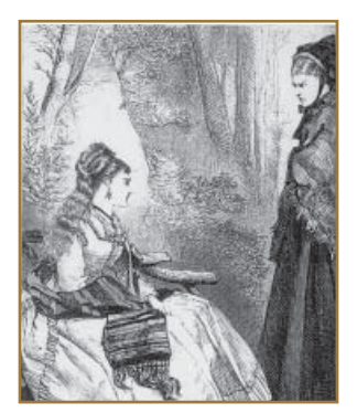
A Lovely Woman's honor is in jeopardy because of a flower bed.