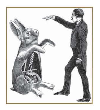
A family heirloom is rebuilt by a Mathematician.