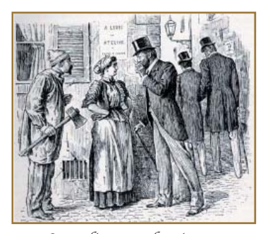
Startling confessions from a Hat Maker.