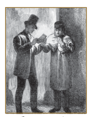
A summons to an early morning assembly at a Private Club.