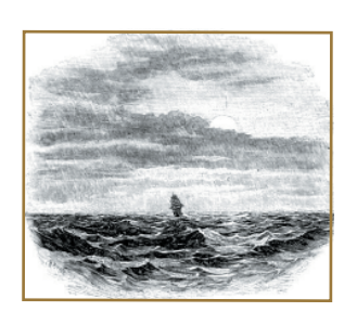
A ship arrives three days late (and with Several Mates missing).