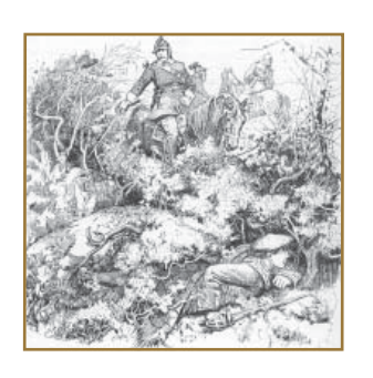
The moment of truth for a Soldier.