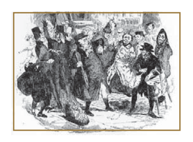
A theatre is evacuated in mid-performance.