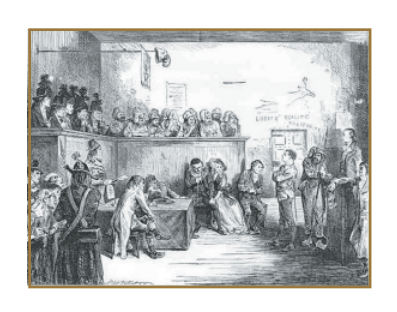
A court case requires Expert testimony.