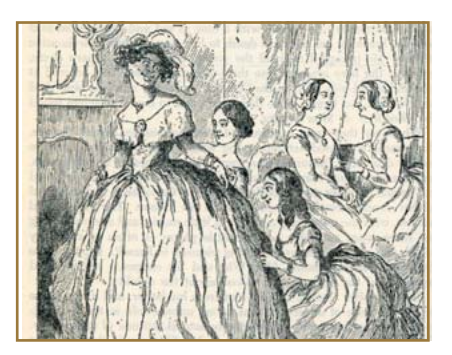
A ball requires the commission of a new outfit...