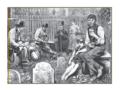
A sojourn to a small village to verify the dates on a tombstone.