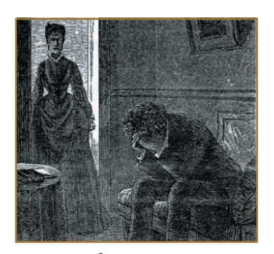
A Fleeing Fiance leaves something behind.